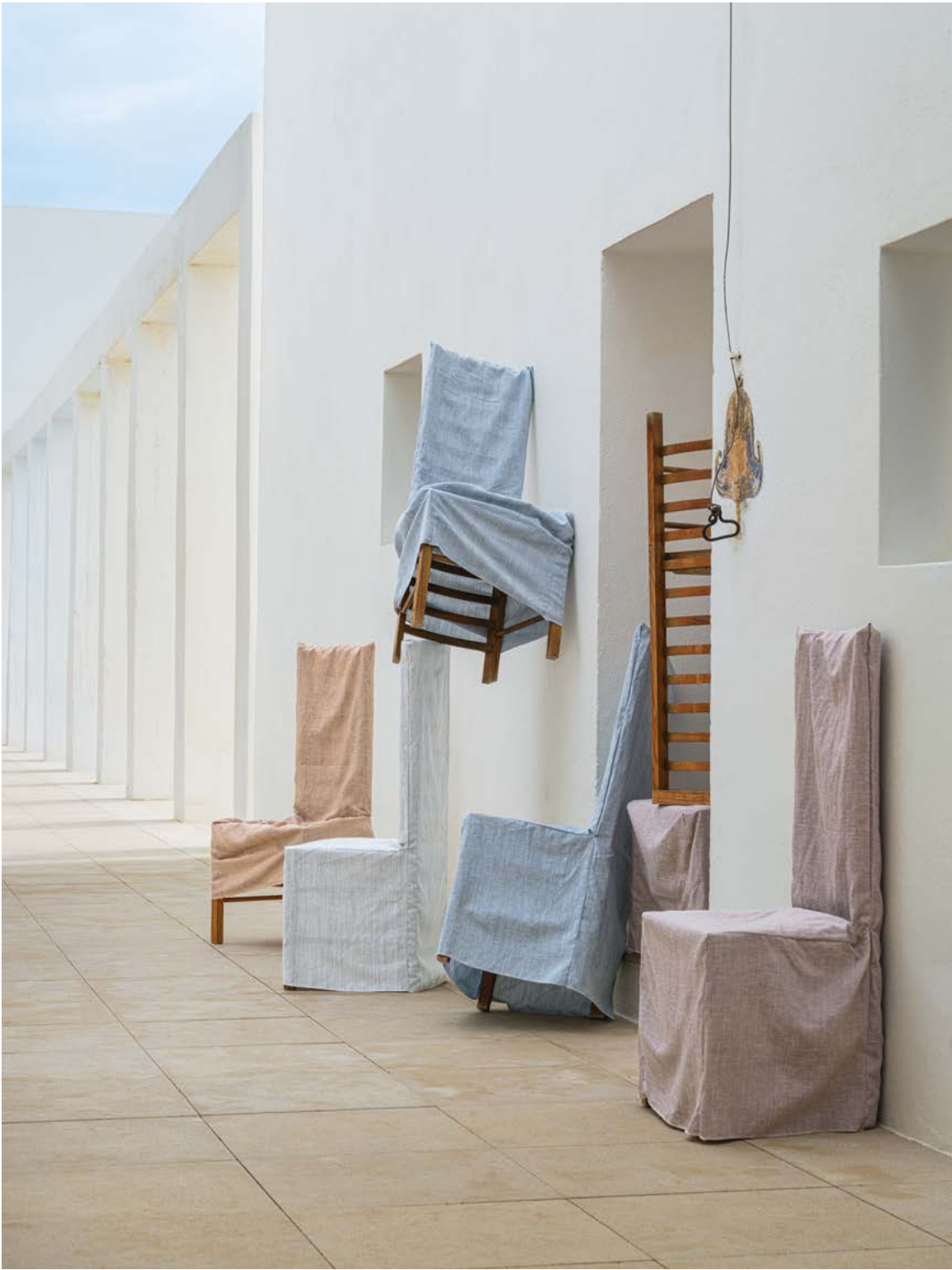
RAMATUELLE A fabric made with a yarn-dyed linen warp and wool weft. A delicate mélange with a gentle stone-washed finish leaves it soft and structured.