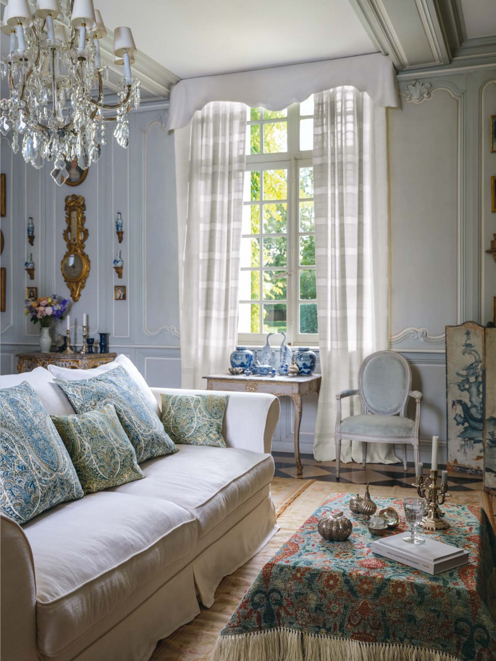
PASSAGE STRIPE A decorative block stripe design with 'scherli' technique on a translucent linen base fabric. Double width, to be used both as a vertical or horizontal stripe.