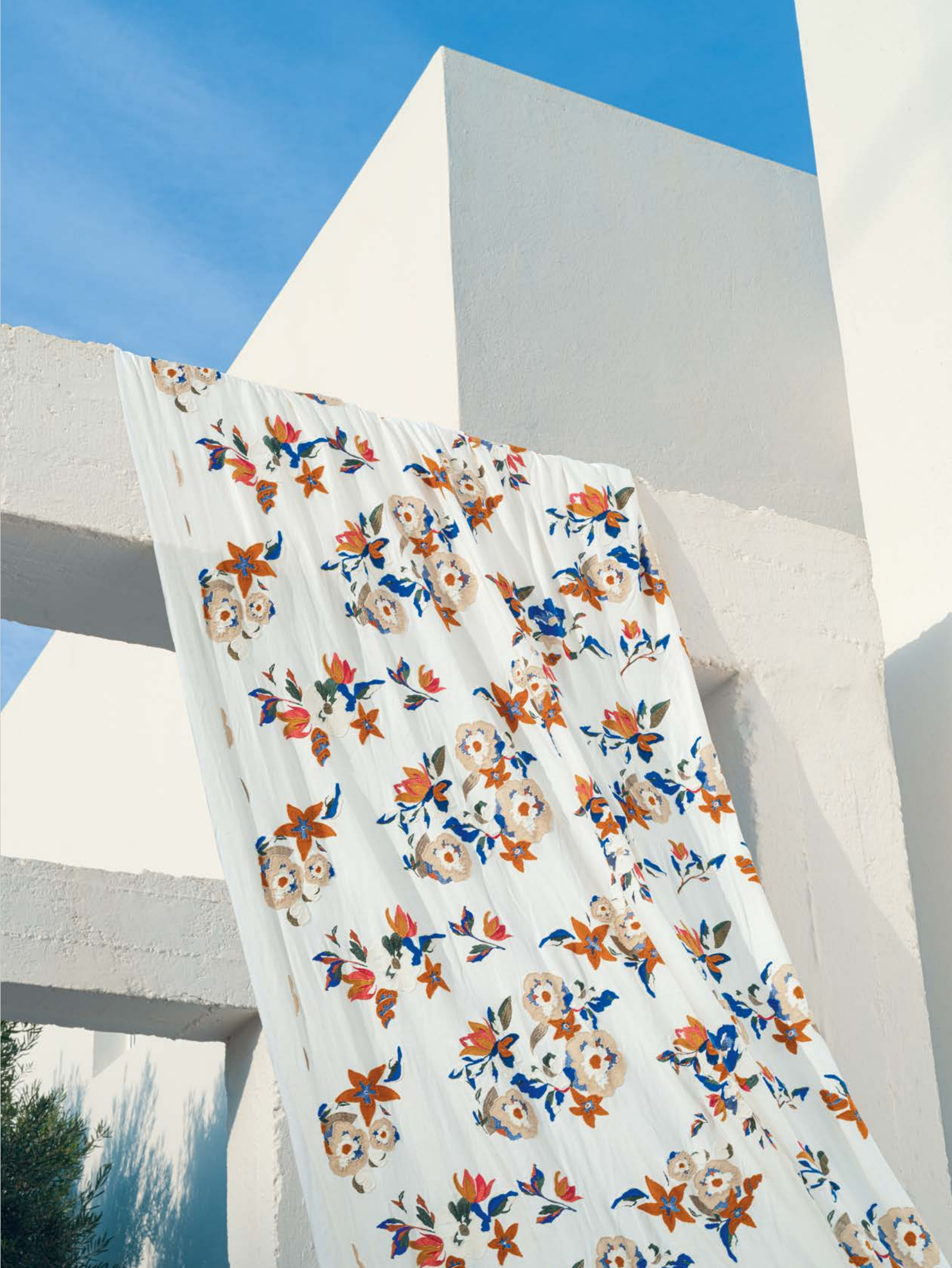
MAUSSANE Embroidery elevated to an art form: poppies rhythmically weave and intertwine, with every detail embroidered in chain stitch using a matte wool thread.