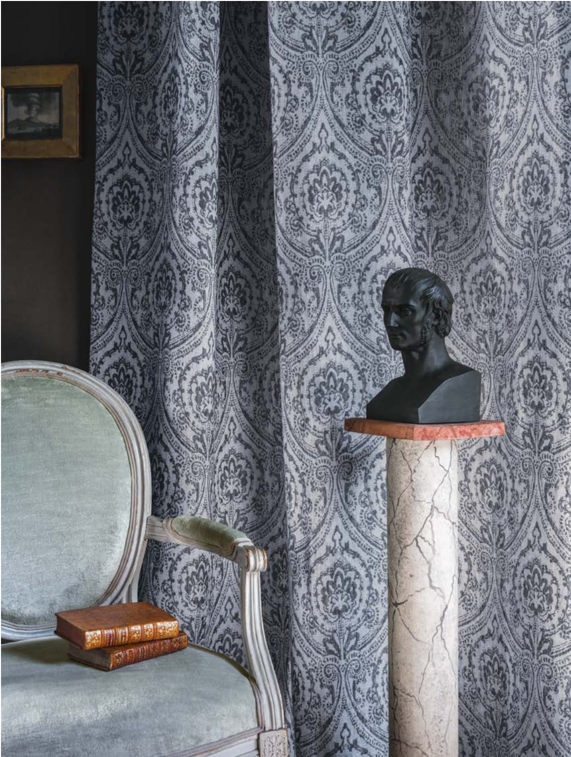
JOSEPHINE The reinterpretation of the classic damask motif as a semi-transparent double weave adds summery lightness to the decorative all-over design.